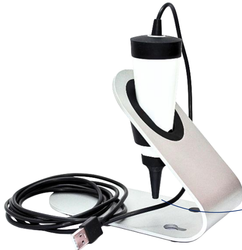
Sensor with precise optic